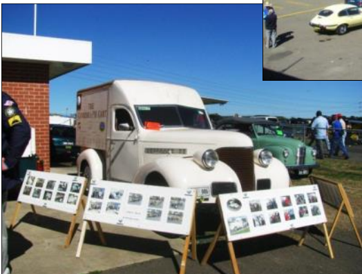
Canberra pie cart.