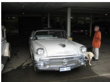
Herne Buick and Biggs TR 3