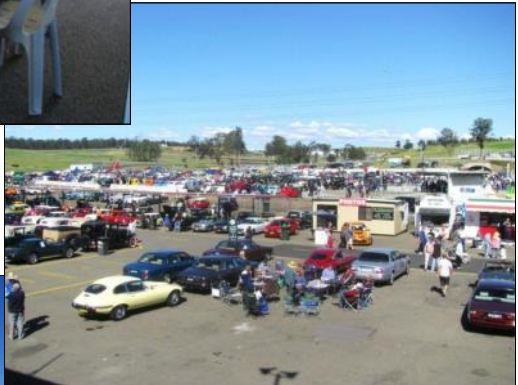
Panorama of the display