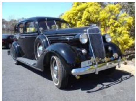
2010 Winner of Restoration of the Year pre-1945.