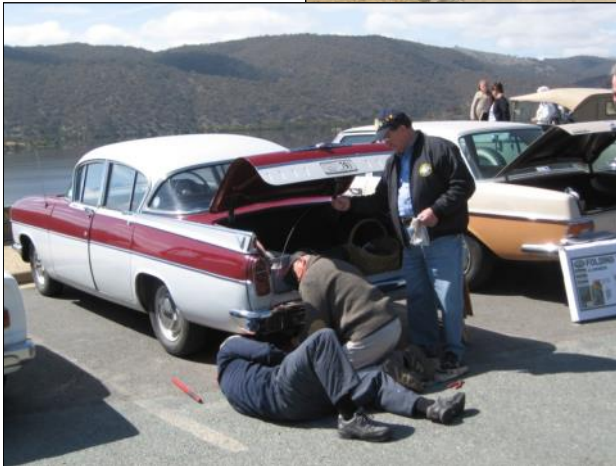
Securing Gerry's exhaust.