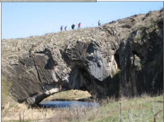
London Bridge with some of the members walking along the top.