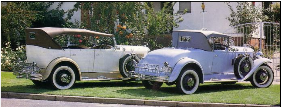
The two Buicks mentioned in this story - Phaeton and Roadster.