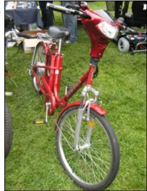
Hybrid Synergy Drive

The silver Toyota car with the bonnet up Rego - YFT 280.