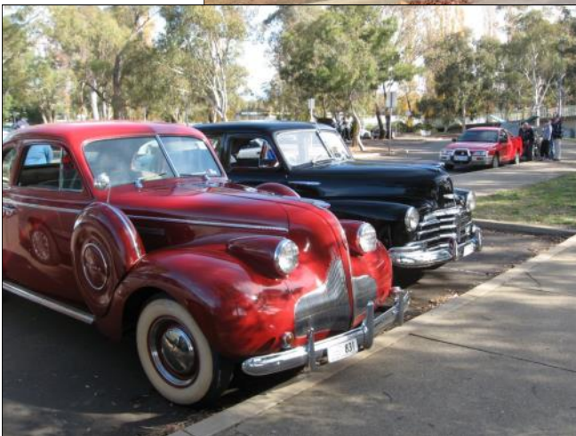
The Boyce cars at Acton Park.