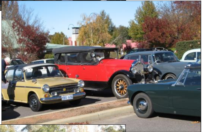
A few of the cars including the Tooles 1927 Buick