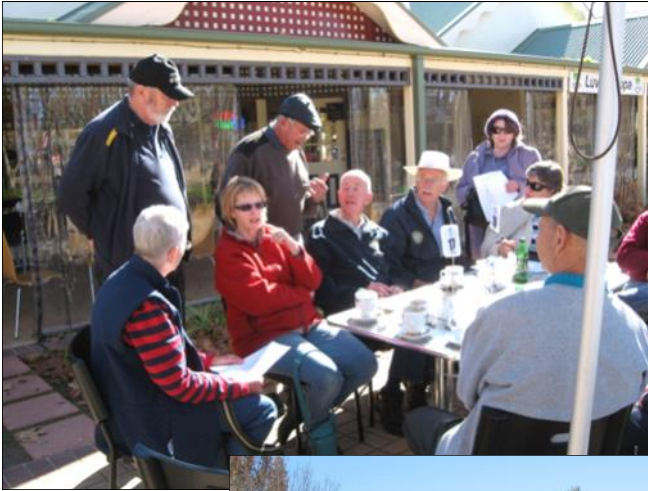
Coffee time at Federation Square