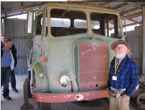
Truck in need of restoration