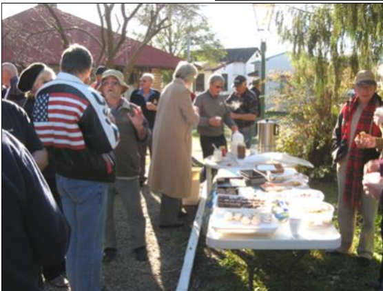
Enjoying the beautiful homemade slices for afternoon tea and some fellowship with Cowra & Cootamundra members.