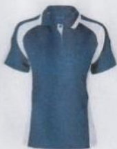
Ladies Polo Shirt with Embroidered Club Logo $40.00