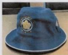
Club Bucket Hat with Embroidered Club Logo $30.00