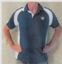
Mens Polo Shirt with Embroidered Club Logo $40.00