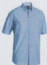
Short Sleeve Shirt with Embroidered Club Logo $55.00