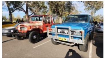
A small selection of the vehicles at Canberra Cars N Coffee—April 2024