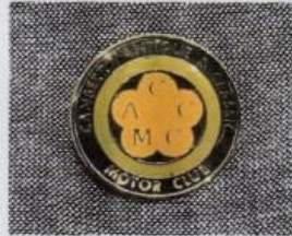
Club Lapel Badge