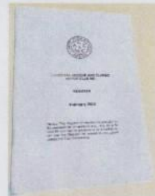
Club Member's Booklet