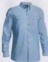
Long Sleeve Shirt with Embroidered Club Logo $55.00