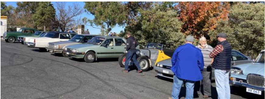
A chat in the sun before departure