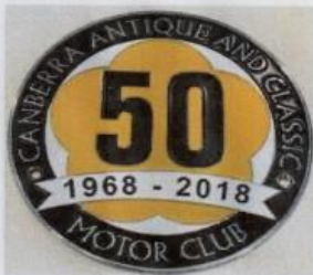
Club 50 Year Badge