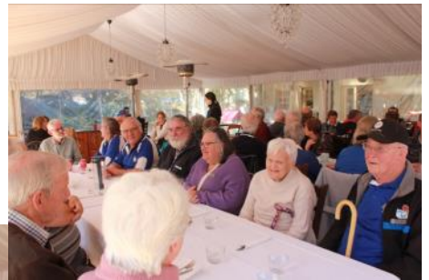
2024 CACMC Presentation Lunch