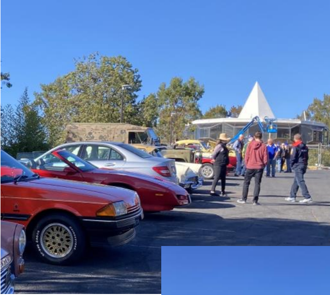
Club members and their vehicles gathering at Redhill Lookout