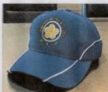
Club Cap with Embroidered Club Logo $25.00