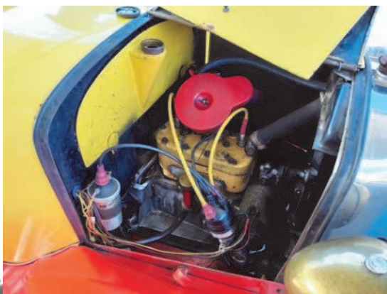
Austin 7 motor

I wish I could see the price of the petrol in the photo on the front cover.