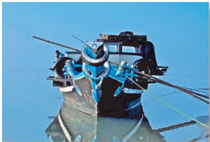
Crossing the Brahmaputra River in northern India

This fantastic photo is from the September 2021 issue of the UK magazine, Classic and Sports Car . It accompanied an article called A Long Indian Summer , which described an 8,000-mile journey across India in 2012 by an English couple, driving a 1937 Rolls Royce.