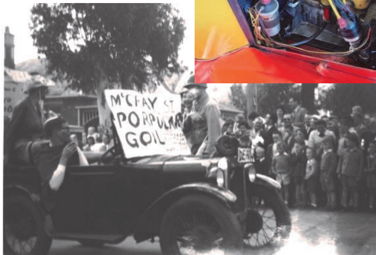
100 years of Austin 7 this year.