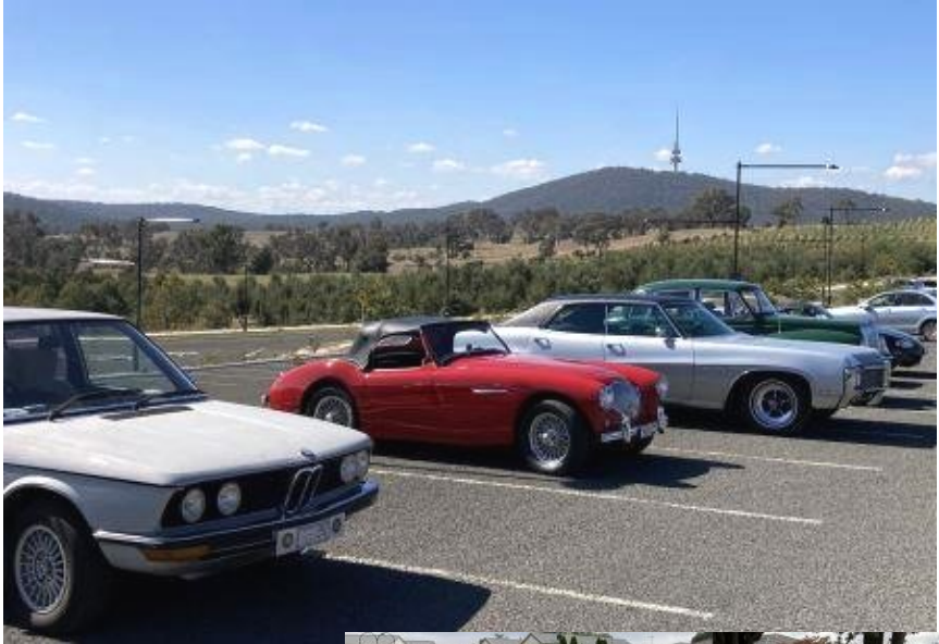
Club cars at the Arboretum