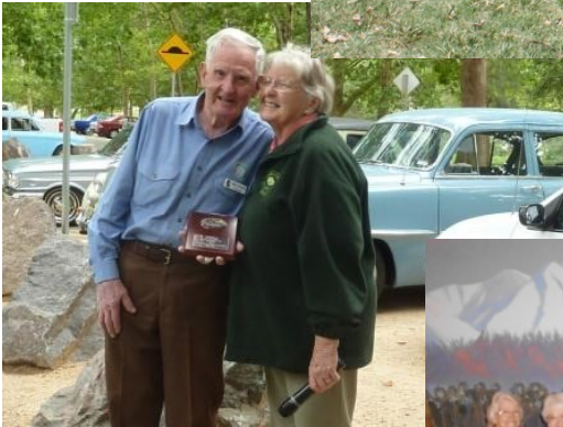
Thank you from visiting car club from Bendigo