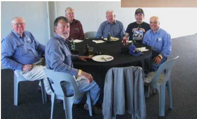
At Eastern Creek