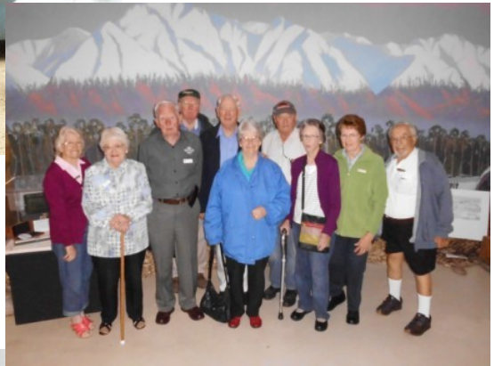
Morris Owners Group weekend away at Adaminaby