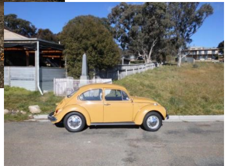
The Wyatt VW Beetle at Collector and their Fairlane