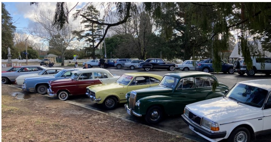
Volvo, Daimler, Monaro, FC Special, Lincoln, Valiant, Buick, Ford Capri, Land Rover, P76, Honda, Buick and Cressida bring classic beauty to Braidwood’s Ryrie Park

At the rendezvous by Braidwood’s Ryrie Park, a fine range of cars showed off the variety of vehicles that we welcome in CACMC. People strolled up and down the Braidwood main street, finding refreshments from local businesses and fossicking in the quirky shops that were open. Others enjoyed their picnics in Ryrie Park. Many commented how good it was to be out and about again, after so long confined.