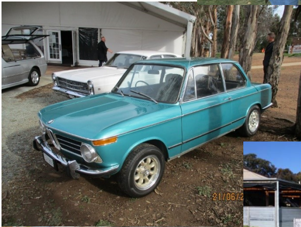
The Wyatt Fairlane and BMW outside the temporary chapel at the Crematorium on 22nd June.