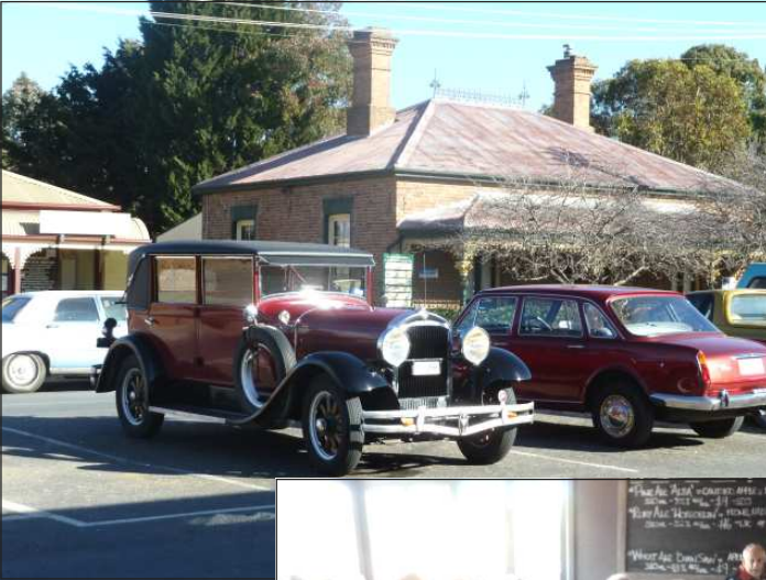
Garrett's 1929 Hudson and Gallagher's 1972 Austin