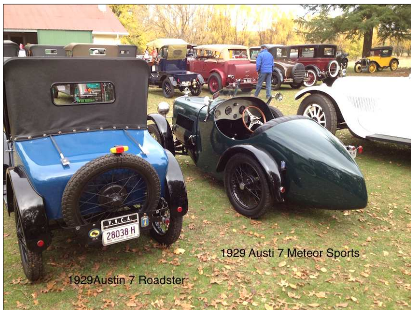
1929 Austin 7 Roadster