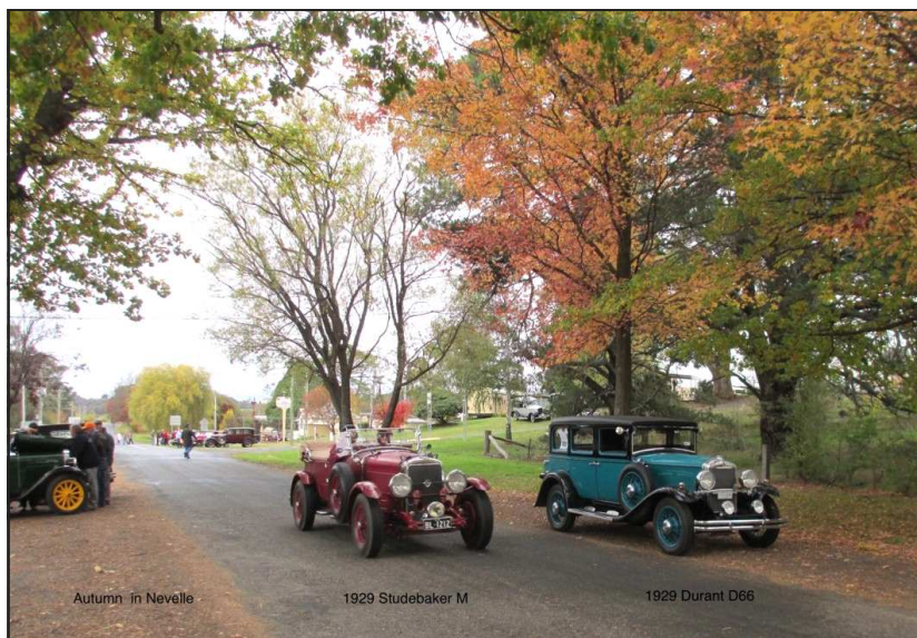
Autumn in Neville