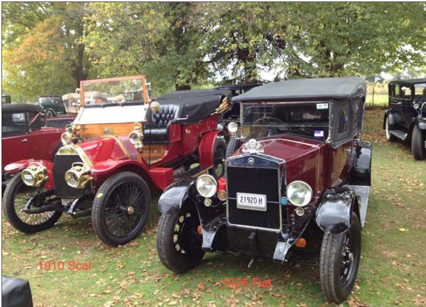
Orange District Antique Motor Club Autumn Tour 2015 Peoples' Choice winner 1910 Scat Tourer on left and 1926 Fiat.