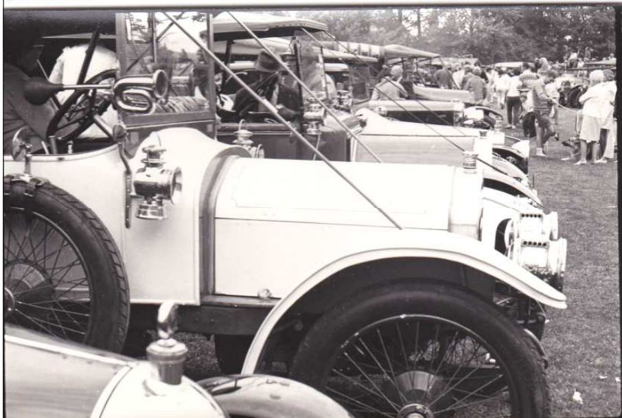
See page 26 for story relating to the 1970 Bi-Centenary International Veteran & Vintage Rally for cars and motorcycles. This is a general view on display day at Northbourne Oval, Braddon.