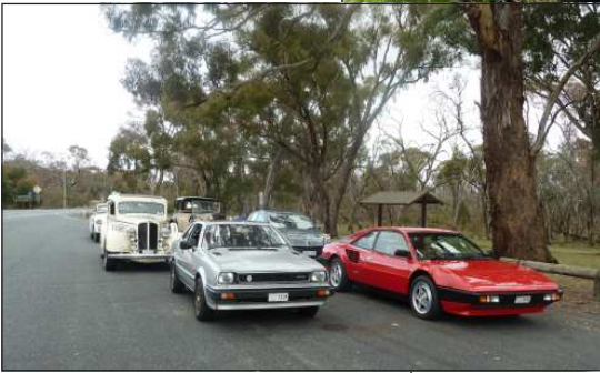
Cars at Hall lay-by