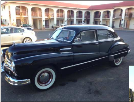
First night in Narrandera NSW

The 2014 Buick Nationals were held in Perth in September this year. Approximately 30 cars met in Tanunda before driving across the Nullarbor to meet the West Australian club for a week in Perth before heading north to Geraldton and Kalbarri.