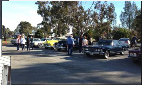
Buicks on show at Tanunda SA