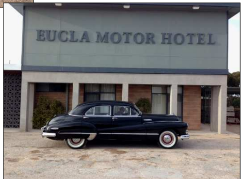
Next stop Eucla WA