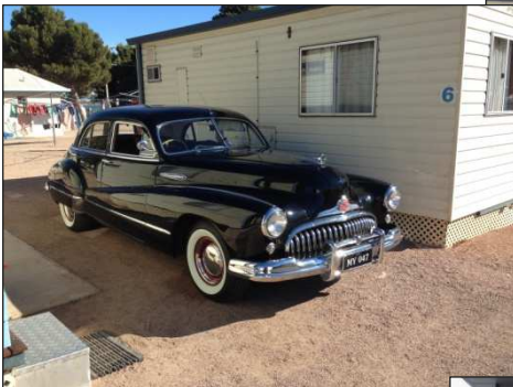
Made it to Ceduna SA