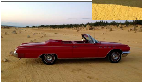
Buick Electra at the Pinnacles, Cervantes WA