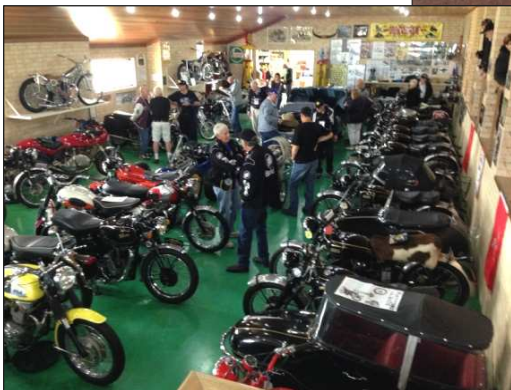
Large collection of HRD Vincent motorcycles (in a private home)