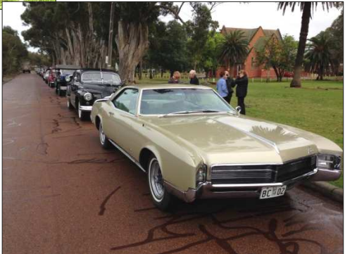
Setting off for Cervantes WA