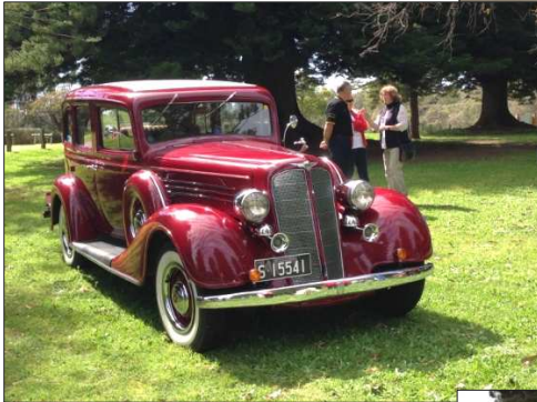
Lunch at winery WA