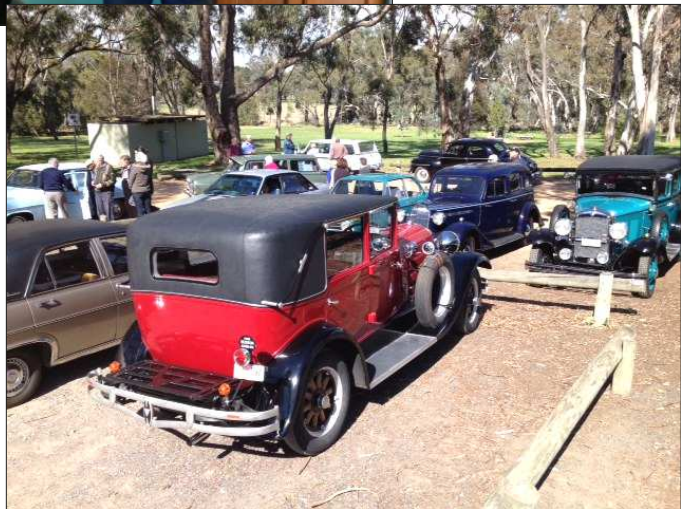
Cars at the assembly area.