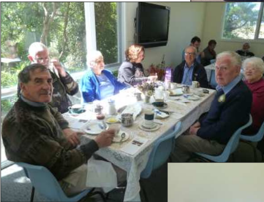
Enjoying morning tea.