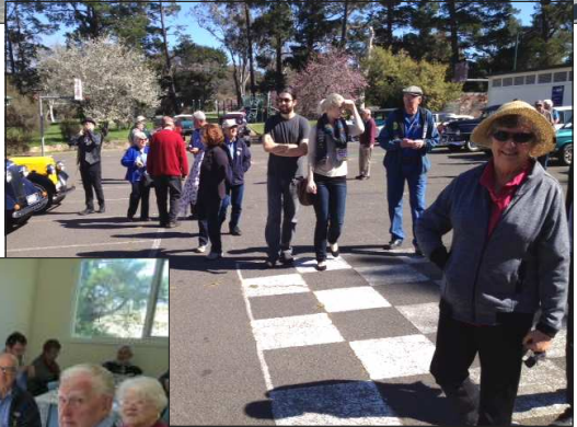
Enjoying the walk between exhibits.