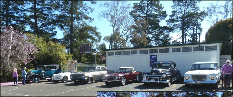
Cars in the school quadrangle.