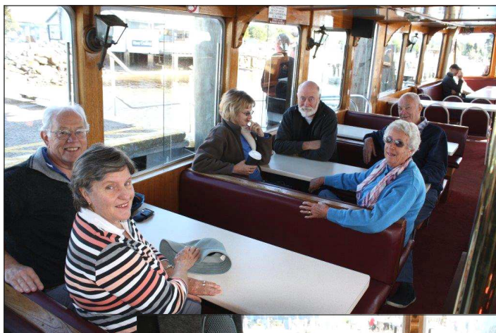
Members enjoying the trip on The Escapade .