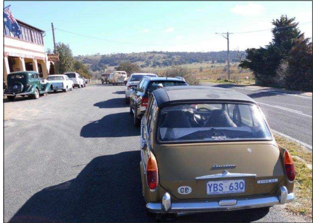
Dave Byers' 1972 Vanden Plas and more old cars as far as the eye can see in the distance on a beautiful winter's day.