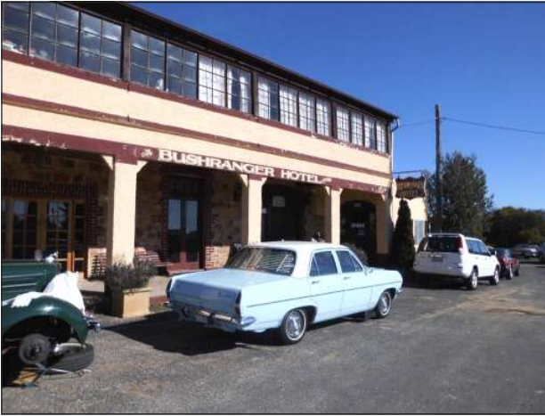
Vin Liston's HR Holden in pride of place outside the Bushranger Hotel, Collector.