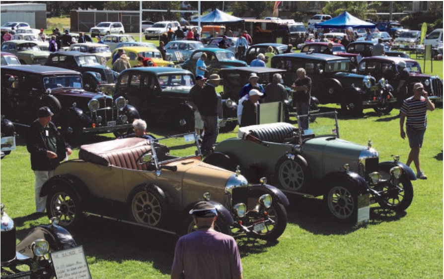
A section of the 100 Morris vehicles on display at the Morris Registers Australia national Rally at Forbes over Easter

Sunday night's presentation dinner was a huge success with many entrants getting in to the spirit of the theme of bushrangers and dressing in clothes of yesteryear. The trophy presentation went off without a hitch as trophies were presented to all classes of vehicle and the people's choice going to a 1915 Morris Oxford.