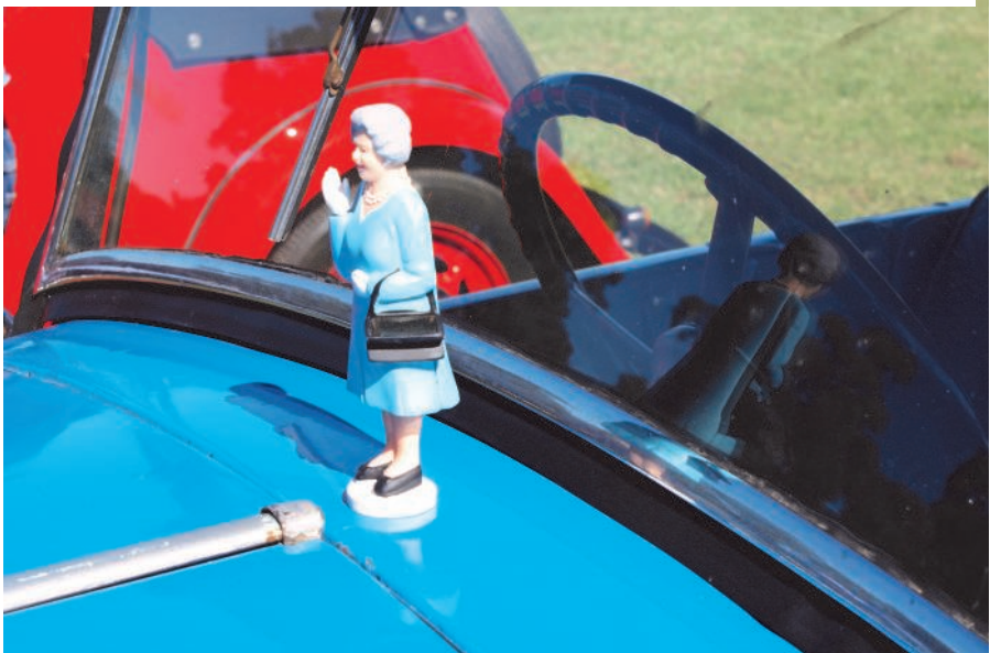
Yes—even she was there!