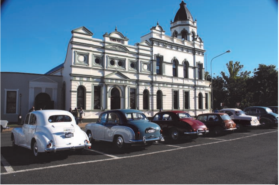
Morris vehicles at the Forbes Town Hall —obviously all facing the wrong way!