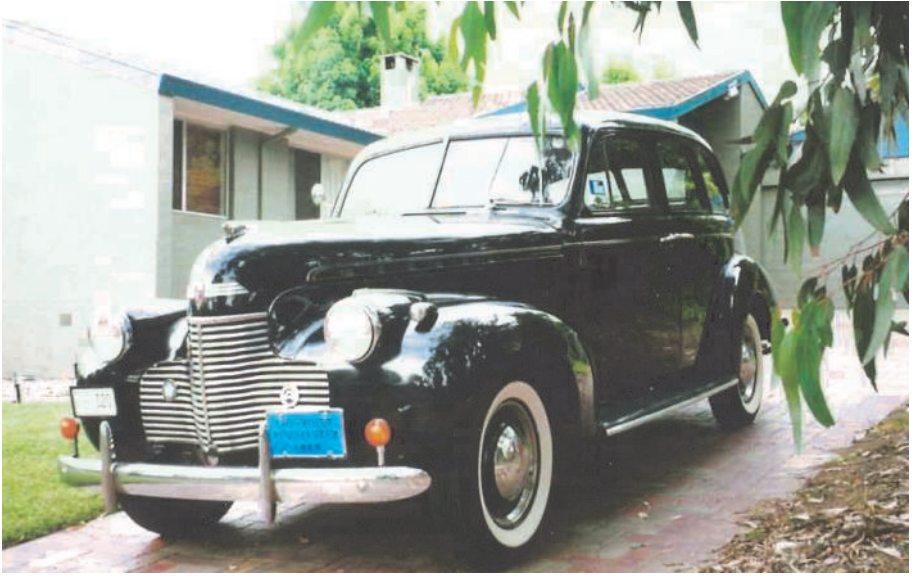
Tim Fishburn's 1940 Chevrolet—see the For Sale ad on page 29