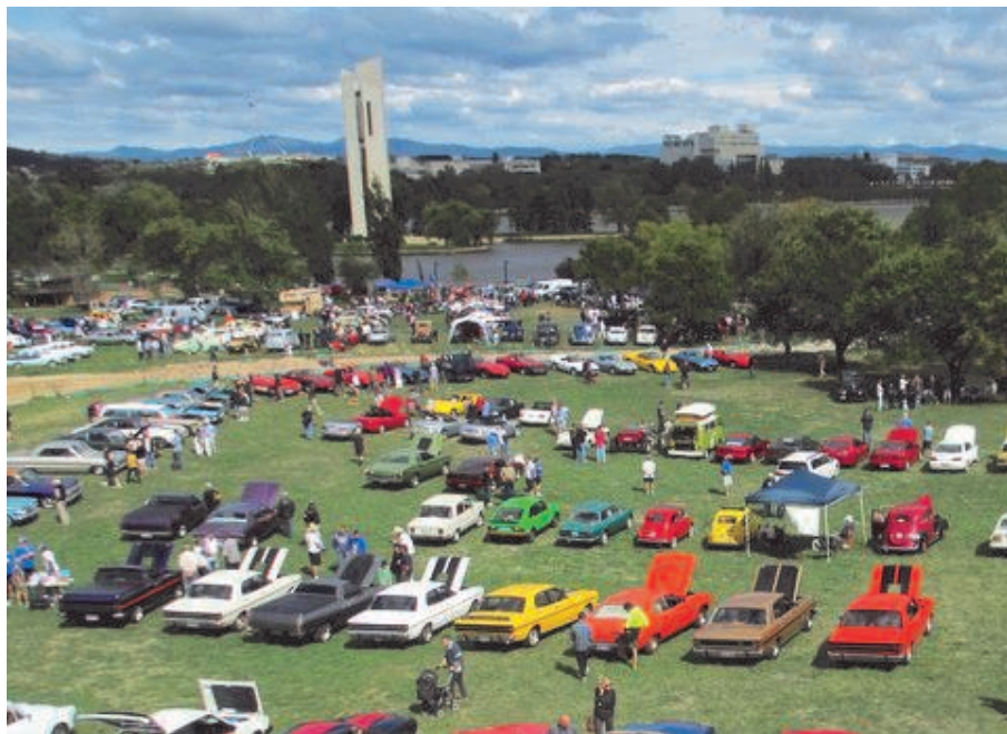
SHANNONS WHEELS EXHIBITION—2014 CACMC is in the top left hand corner