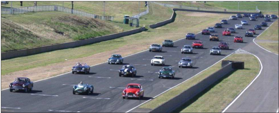
Aston Martins doing a parade lap