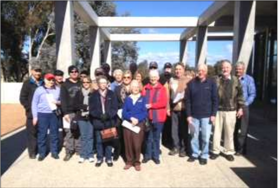
The group at the War Memorial for coffee and the start of the run.