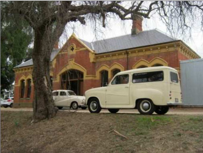
Pair of Austin A30/35s outside Maldon Railway Station