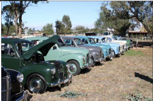
A line up of Austin A40s