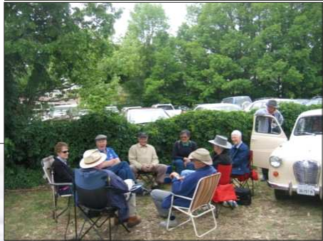
CACMC members relaxing