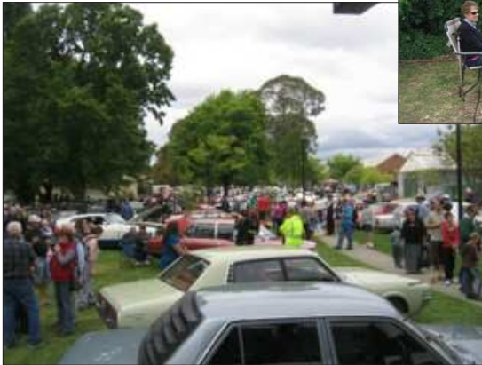
Overview of the gathering