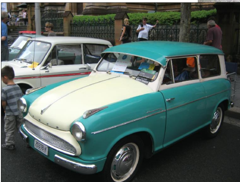
Australian designed and built Lloyd motor car