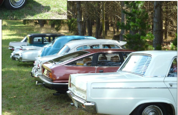
Another 7 cars parked in the shade.