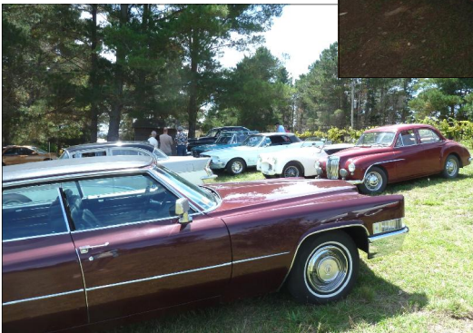
A selection of the cars at Little Bridge Winery