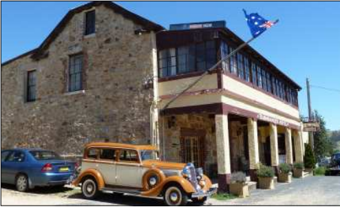
Butterfield Chrysler near the hotel Memorial stone near the hotel

A very pleasant day and a good roll-up - in pictures