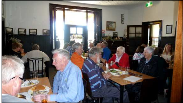
Some ate inside in the dining room.