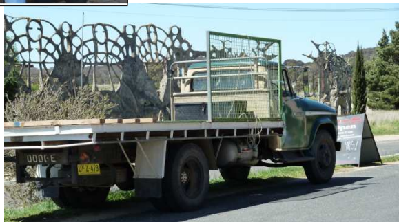
Norm's truck out front and that sculpture across the road.