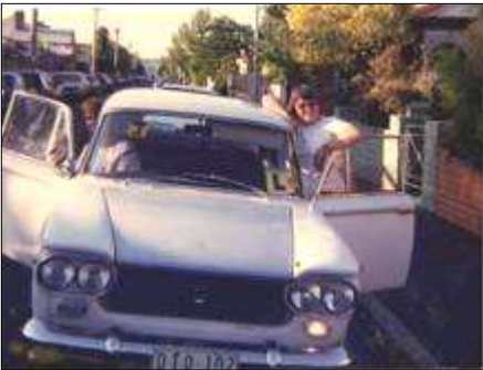
Taking my car for one of its first drives on my learner permit.

As you can imagine, with all that power under the hood, it was inevitable that a new P plate driver would try to take advantage of it. I crashed my poor car just three months after getting my licence but thankfully walked away without a scratch. I put my spare white 1500 on the road for few years, then came across a very good blue 1500 that I found at a wrecking yard. $150 later I had the car that I used for my wedding, and still own today. I'm pretty sure there are still a few donor parts of my original 1500 that continue to travel with me.